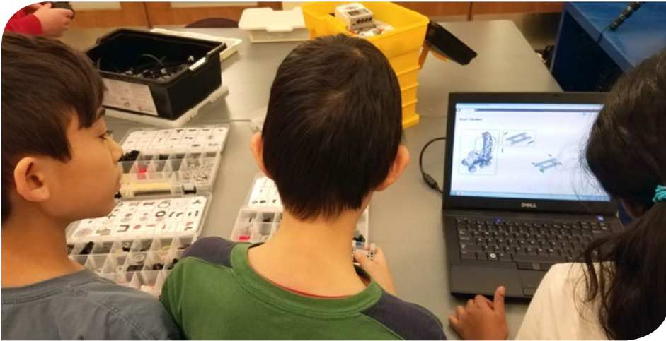
Students in grades 4 & 5 participated in a 6-week workshop learning how to code and operate LEGO Mindstorm Robots.