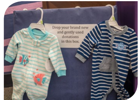
Above: Clothes Donations: Drop off new or gently used children's clothes in our donation box.