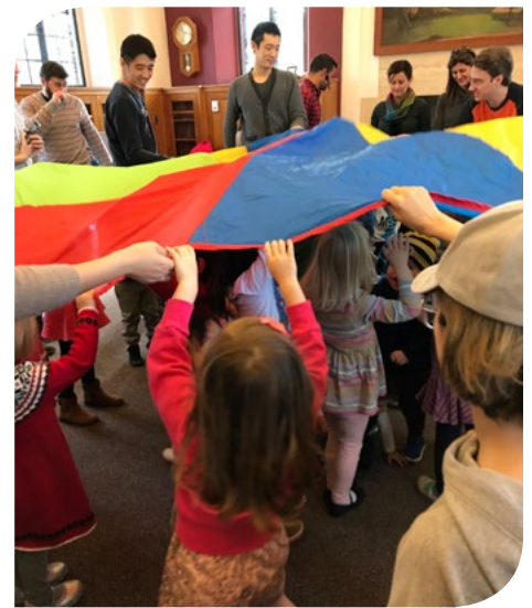
Rockabye Beats: Practicing our best dance moves with this fabulous bilingual music program.