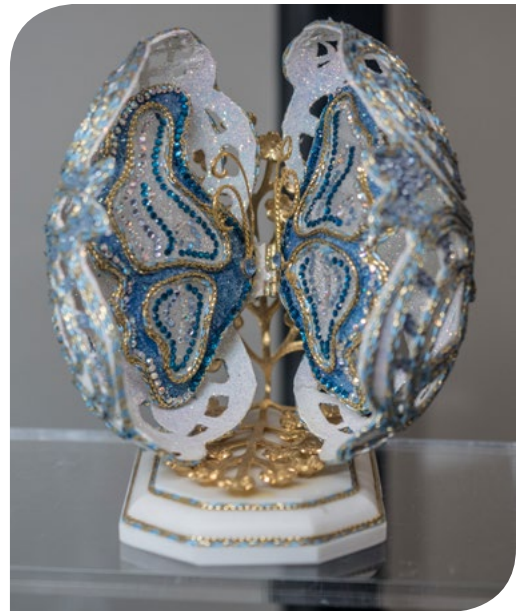
Recently displayed work by the Winchester Artists' Network in the lobby display cabinet donated by the Friends.