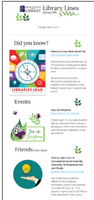
The weekly Library Lines newsletter covers upcoming events and highlights Library resources.

library resources. Go to winpublib.org to see what's happening and learn more about the resources available to you.