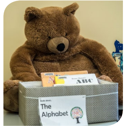
Chester, the Children's Library Mascot, stands ready to play and cuddle.