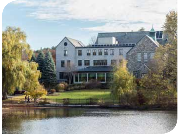
With its new renovation, the Library grounds will continue to be a refreshing part of Winchester's downtown landscape.