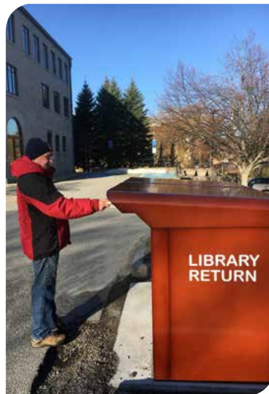
The Library’s new drop off boxes, made possible by a Friends’ donation, make it easy to return books either on foot or directly from your car.

Please remember to check if your company will match your donation.