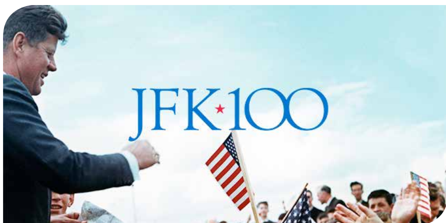
With the addition of the JFK Presidential Library and Museum, our pass program now offers 21 venues.

The program is easy to use: Reserve a pass at http://www.winpublib.org/museum-passes or the reference desk, specifying the number needed (most passes admit 2 persons and for the more popular venues we have two passes.) Then pick up the pass at the reference desk. Most passes are disposable, though a few must be returned the next day. Also, passes are limited to two per week and can only be reserved by those who live or work in Winchester. Happy explorations!