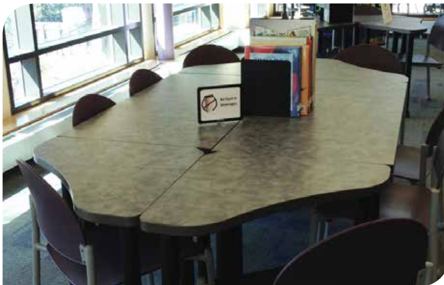
Our new larger tables encourage group work in a comfortable setting.

Two new programs began in February: Itsy Bitsy Readers for children not yet walking and Book Buddies for second and third graders. Contact us at winchild@minlib.net or call us at (781) 721-7171 ext. 322 if you would like to know more about either program and to check space availability.