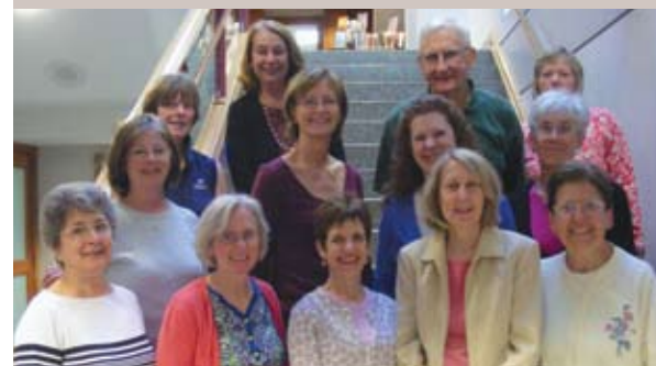
Board Members of the Friends

The Friends of the Winchester Public Library ("The Friends") is the grassroots organization that supports your Library's continuing excellence. We raise funds for publications, equipment, and services which are not included in the town's budget but which enhance the Library's mission of improving the quality of life for Winchester residents.