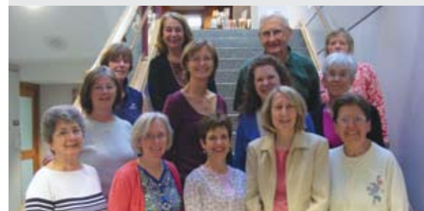
Board Members of the Friends

Another great piece of news from the summer is that we added a part-time children's librarian to our staff in October. This will enable us to add an additional program on Fridays and occasionally on Saturdays. Our Friday program, starting in late October, will be an additional Step into Storytime for children age 2–3. This drop-in program will run most Fridays beginning at 10 am.